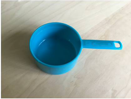
A measuring cup

Practice: Point to tools and ask your student to name each one.